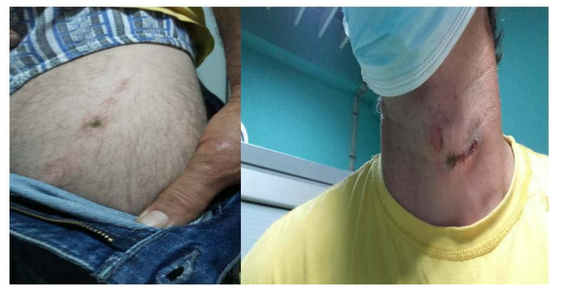
Fig. 1 – The entry wound on the left thigh and exit wound on the neck.

The mechanism of AF occurrence as a consequence of an electric shock is complex and only briefly examined.